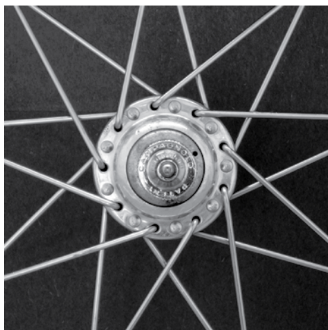
Exhibit 1: Bike Hub Styles

Your company designs and manufactures mechanical components for bicycles and you are embarking on a project to design a new hub for a spoked wheel. The important engineering work is in the bearings, the seals, and the quick-release mechanism, but the flanges (see Exhibit 1) are a controversial style issue. The flange design task consumes about 35 percent of the design budget.